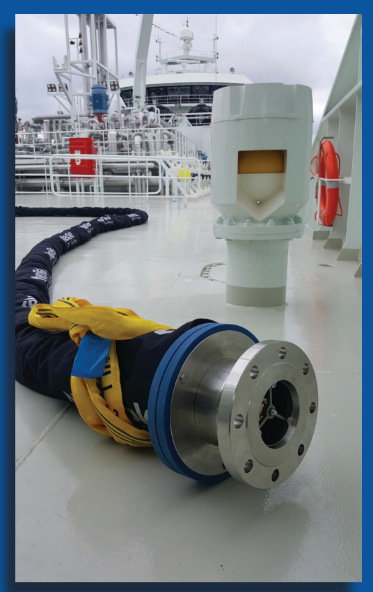
Coralius is fitted with Mann Tek 6-inch PERC and wire drift ESD system.

With a capacity of 5,800 cubic meters of LNG, the Coralius is highly suited as a small-scale carrier, featuring a ship design that includes a flat working deck specially engineered for side-by-side transfer of LNG.