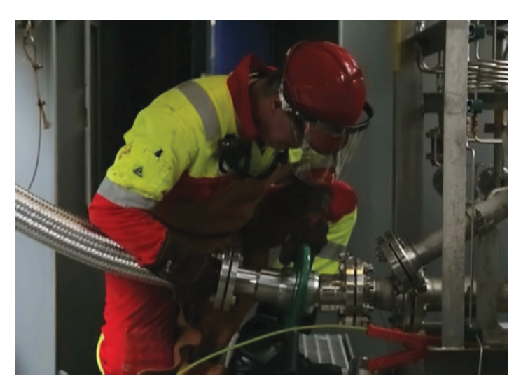
Ship's personnel make a connection of the bunker supply hose to the ship's bunker manifold.

Also important for any pressurized liquid system involving LNG is to ensure that the product is transferred without incurring damage to the piping and possible leakage. "Not only is LNG highly volatile and ignitable, the extreme cryogenic temperatures of LNG also require special materials for handling – such as in the case of ship hull steel which can become immediately brittle, crack and fail when exposed to LNG," Gilman notes.