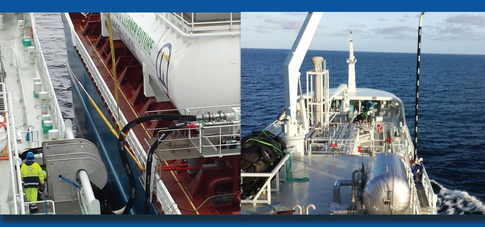
Coralius performs ship to ship LNG bunker operation.

The success of the Coralius continues the notable success of LNG bunkering activities for Sirius Shipping, with nearly 1,400 such operations carried out to date thanks to MannTek's innovative system engineering. Indeed, MannTek is the most important supplier of LNG transfer equipment to the major LNG fueling facilities throughout the world. In addition to the M/S Viking Grace (the world's largest passenger ferry), other notable MannTek LNG transfer system installations include Tote Maritime's M/S Isla Bella (the first LNG-powered container ship) and Harvey Energy (the first LNG-powered OSV in America). Dixon supplied the couplings for the Harvey Energy project.