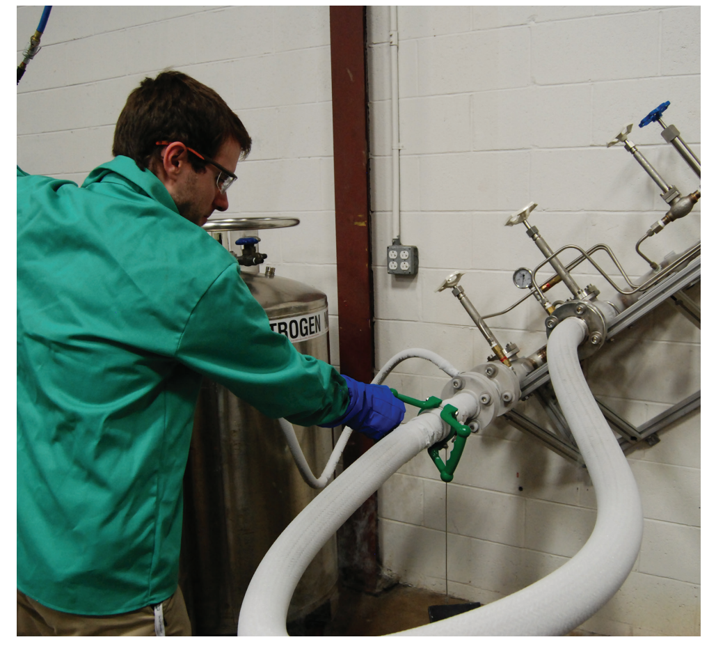
In the case of the new ASTM standards being developed for LNG bunkering hose transfer assemblies, a full spectrum of specialist were involved.

subcommittee for Piping and Machinery (F25.11) along with several task groups. Their mission was to start development on newlyidentified work items as well as to ensure that the specific stakeholders in the LNG-as-fuel arena have an opportunity to contribute their expertise to the effort.