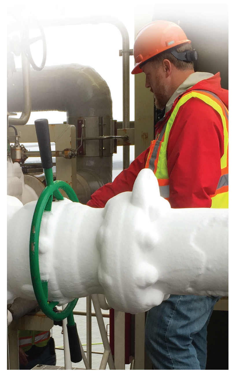
Ice builds up on the 6-inch LNG transfer lines during a ship bunker. The extreme temperature of LNG can cause damage to the ships structure if exposed to the LNG directly.