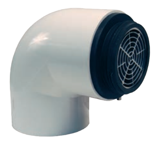
adapters and caps sold separately