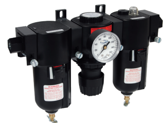
with metal bowl