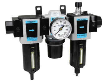
with metal bowl