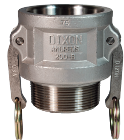
316 stainless steel