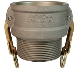
aluminum hard coat