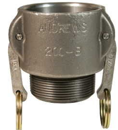
unplated malleable iron