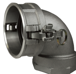
EZ Boss-Lock design