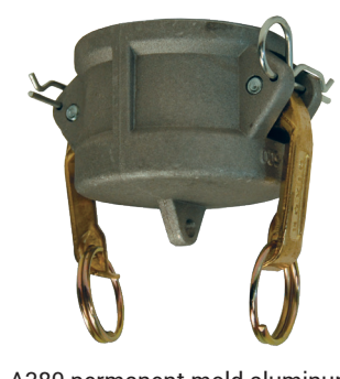
A380 permanent mold aluminum