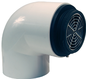
adapters and caps sold separately