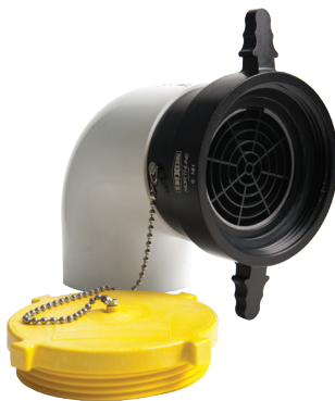
adapters and plugs sold separately