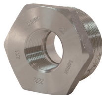
3000# forged steel