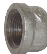
150# galvanized iron