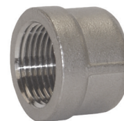
150# 316 stainless steel