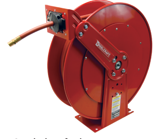
See below for bumper stops, consult Dixon® for uses other than stated services