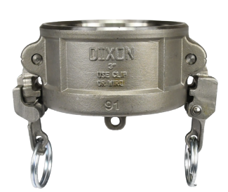
316 stainless steel