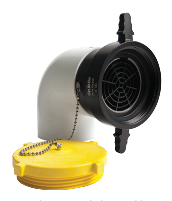
adapters and plugs sold separately