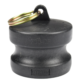
3/4" - 3"