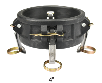
Type P Dust Plugs