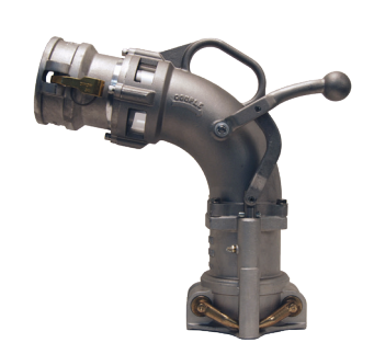
side lever with 4" coupler inlet