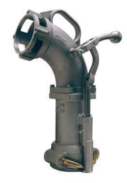
side lever without inlet connection