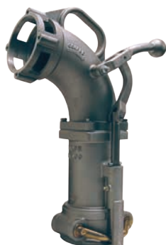
side lever without inlet connection