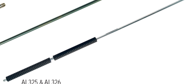
AL325 & AL326